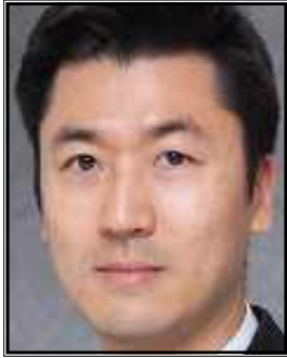
Dr. Sangjun Park Outstanding Scholarship