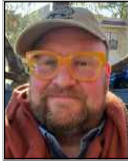
Dr. Corey Twitchell Outstanding Scholarship